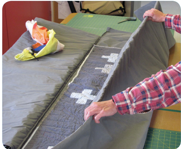
Products made for donation at the Mary Hutchinson Women's Prison