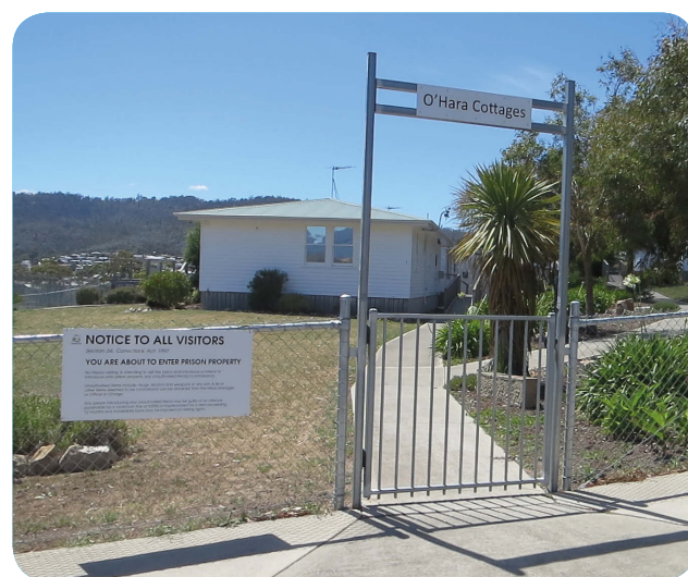
Transitional accommodation at the O'Hara Cottages outside the Risdon Prison Complex