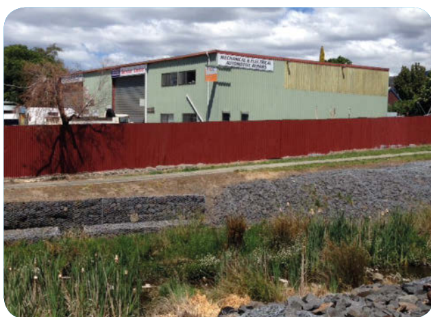
Graffiti removal in partnership with the Glenorchy City Council