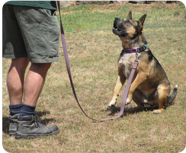
The Pups on Parole program and dog temperament training in association with the Dogs' Homes of Tasmania