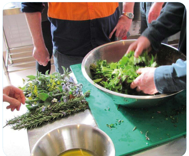
The Food on the Table Program at the O'Hara Cottages