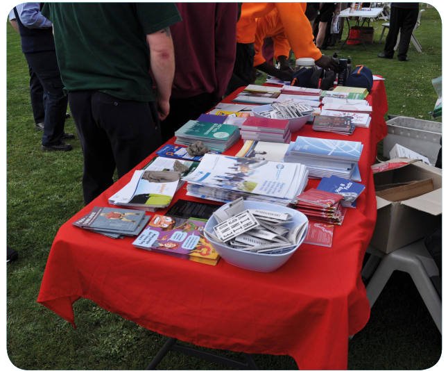
Men's Health Expo at the Ron Barwick Minimum Security Prison