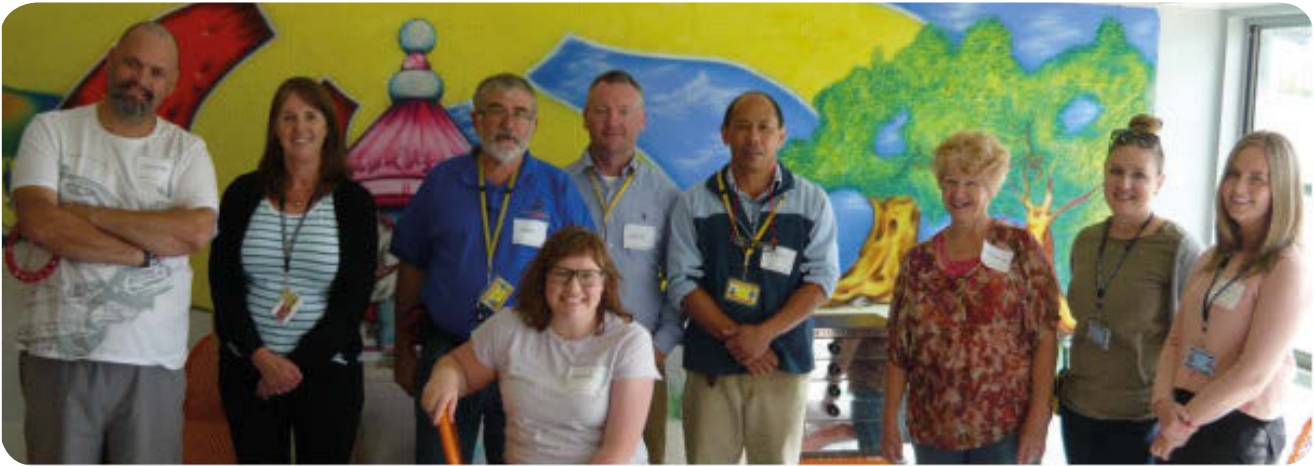
Staff and volunteers at Kids' Day