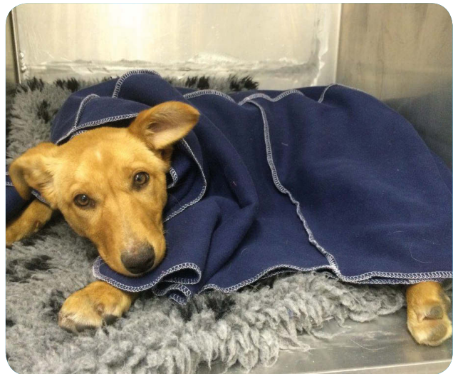
The Hand Made with Pride program produces blankets for the dogs that come out of anesthetic at the Dogs' Homes of Tasmania