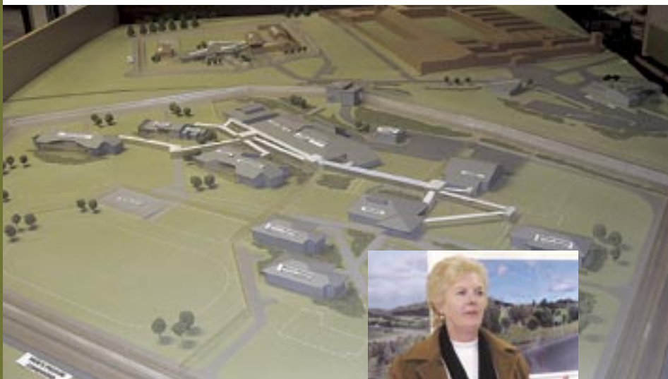
Right: Minister for Justice, the Hon. Judy Jackson MHA unveils the models of the new prisons and Secure Mental Health facilities (above).

For further information about the Prisons Infrastructure Redevelopment Program contact the PIRP Office on (03) 6233 4758, or email pirp@justice.tas.gov.au